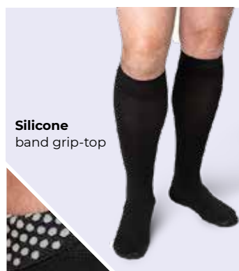
Silicone band grip-top

30-40mmHg Closed Toe Calf Large Long in Black