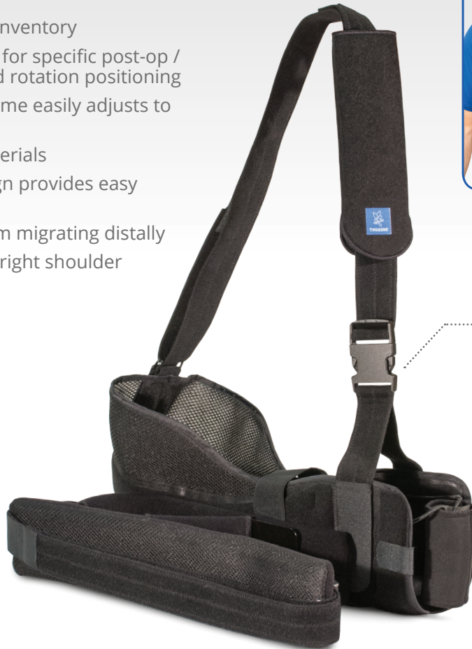
Light weight, breathable materials