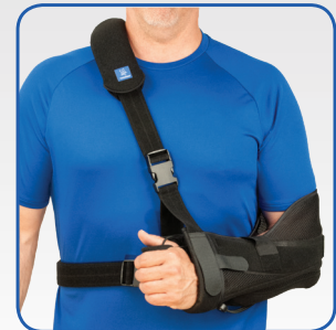
Step down capability